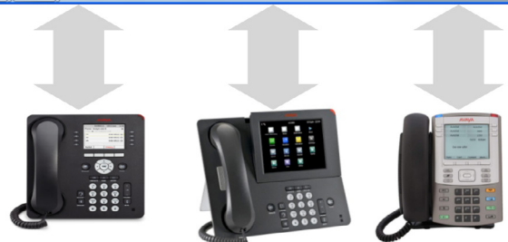
Avaya ACE™ 3.0 Microsoft Lync Integration